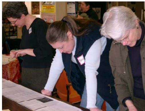
Progress Report: Workshop on Exploring Learners’ Perspectives on Progress

http://www.nald.ca/ppr/researchproject.htm