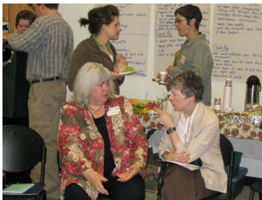
Coffee break at Literacy Northwest Conference in Thunder Bay